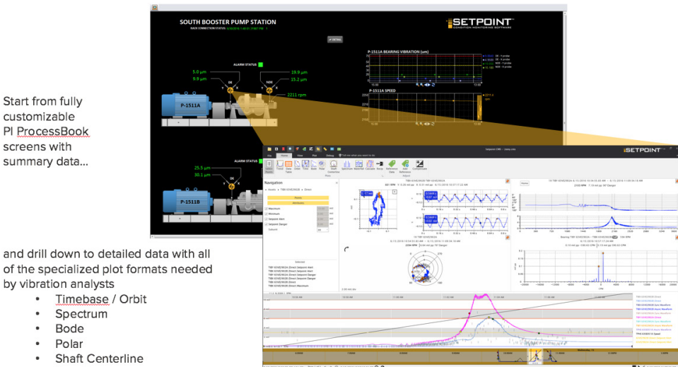
All data (including waveforms!) resides in your PI System

SETPOINT Vibration eliminates the need for stand-alone software and allows you to use your PI System for vibration data, including high-speed waveform data - not just summary static data values and statuses.